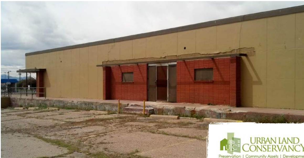
Original Vacant Bowling Alley