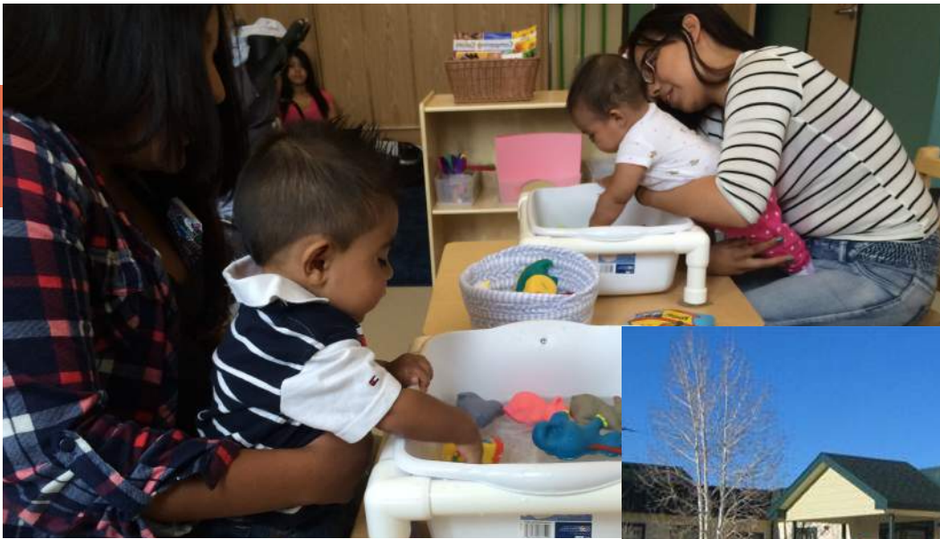
Below picture: Passage Charter School